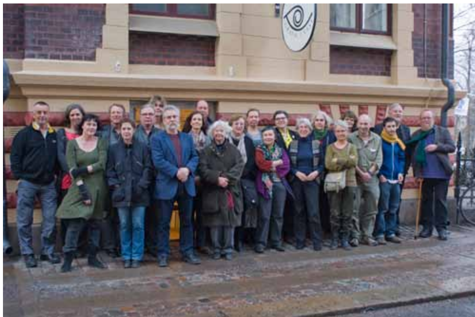
At the annual meeting 2011

Grafik i Väst Storgatan 20 SE411 38 Göteborg +46 (0) 31 7113839 www.ramverk.se/giv giv@ramverk.se