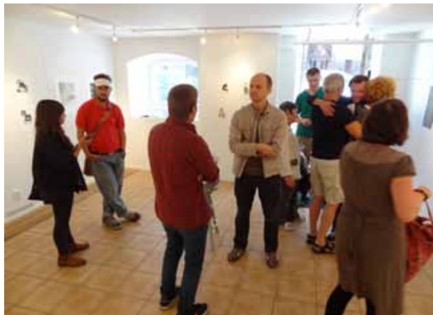
Exhibition with new members 2011

Grafik i Väst aims to connect artists through its coordination of exhibition production for members, guest printmakers, national and international printmaking organizations with a global public.